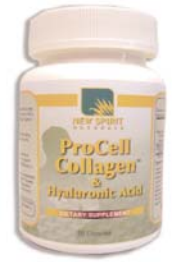
ProCell™ Item #1510 90 capsules

ProCell™ Collagen is a unique patented bioavailable form of Collagen Type II that has been hydrolyzed for maximum absorption. ProCell's™ molecular composition makes it effective in both the management of joint and skin care. ProCell™ supplies a concentrated matrix of nutrients: Bioavailable Hyaluronic Acid (10%), Depolymerized Chondroitin Sulfate (20%), Collagen Type II (70%), and a newly discovered antioxidant in proteoglycans called Cartilage Matrix Glycoprotein (CMGp). In addition to supplying Collagen and Hyaluronic Acid, ProCell™ includes MSM, a great source of biological active sulfur which is important for maintaining healthy connective tissue and joint function. Collectively, the components found in ProCell™ provide the structural support of healthy joints by promoting new cartilage synthesis and by reducing oxidative damage to the joint.